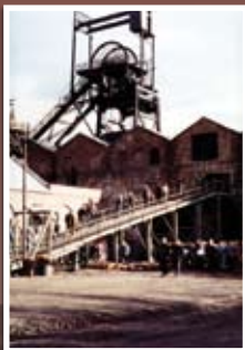
Lady Victoria Colliery

Midlothian, just south of Edinburgh, is home to the historic enigma of Rosslyn Chapel as well as the Scottish Mining Museum, an anchor point of the European Route of Industrial Heritage. Experience the places, artefacts and activities that authentically represent the stories and people of the past and present. Discover the templar connections and seek the truth depicted in the ruined castles, historic churches and mining villages that together tell a story more compelling than the Da Vinci Code.